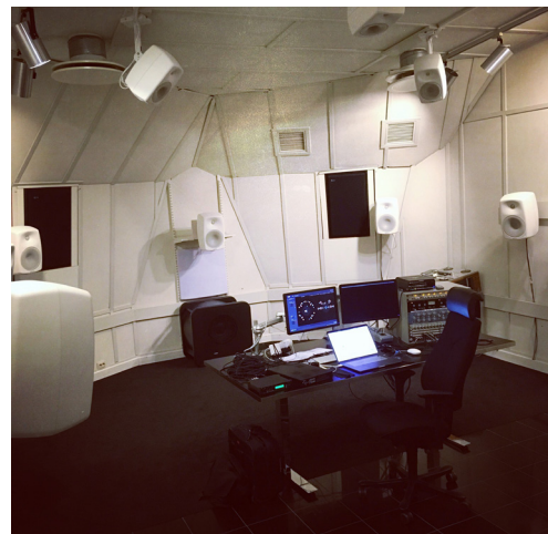
Elektronmusikstudion Spatial Audio Recording Studios