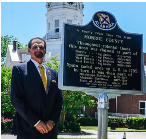
Mayor Charles Andrews